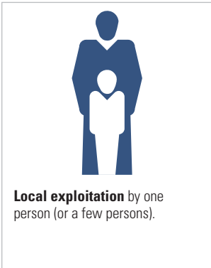
Exhibit 3. Organization of commercial sexual exploitation of children

Exhibit 3, “Organization of commercial sexual exploitation of children,” illustrates the organizational structures of CSEC.